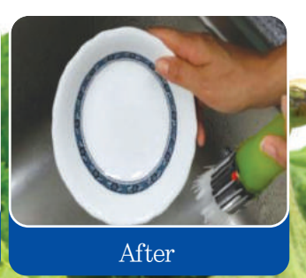
Cleaning pad germ?